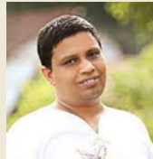
Acharya Balkrishan, CEO, Patanjali Ayurved